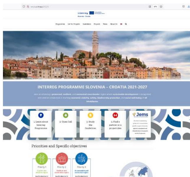
Figure 28: Example - website

In case there is such a project website or Project Partners provide information on the project on their website(s), a short description of the project, including its aims and results, and highlighting the total financial support from the ERDF, has to be included. In case of a project website, the project logo has to be placed in the upper part of the website and should correspond to the language used on the website.