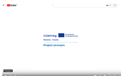
Figure 29: Example - videos

In case projects produce promotional videos, the project logo has to be visible in the beginning or the end of the video in a recognizable size and on suitable background for at least a few seconds.