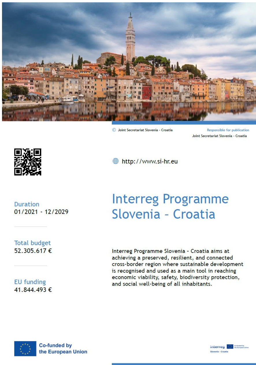
Figure 17: Poster template

permissible. The printed or electronic displays should be set up as soon as the project begins and no later than six months after the approval of the projects.