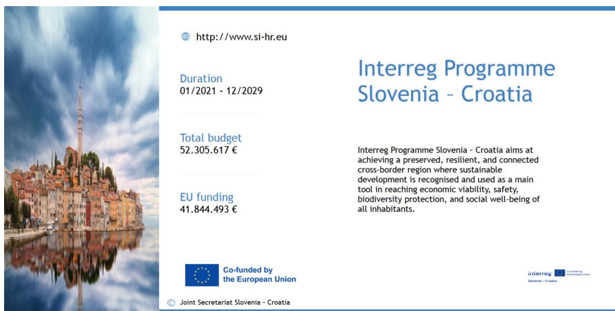
Figure 18: Billboard template

As with the billboard template, the plaque template gives the possibility to provide key information on the project to ensure transparency. Plaques should be placed next to the location where the operation takes place, as they have to be readily visible to the public. The plaque template's main elements are: the title of the activity, the project name/acronym, the project description, project duration (start and end), the total budget/ERDF support received, the project logo, place for other