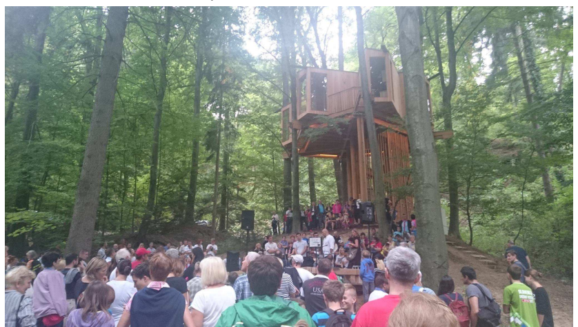
Photo 1: Presentation of project GREEN4GREY in the frame of the event "EU project – my project"