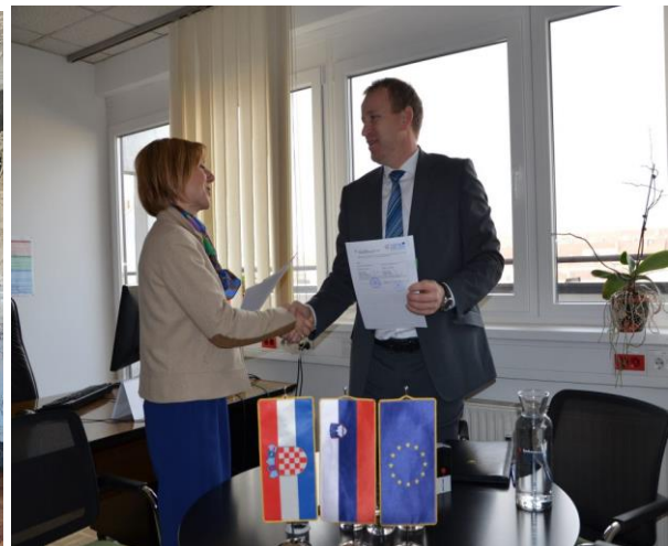
Subsidy contracts signing of the approved projects from the 2 nd deadline of the Open Call and strategic project FRISCO 2.1