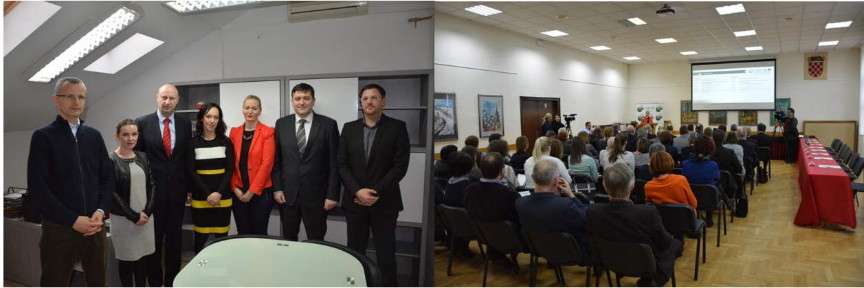
Opening of the JS branch office in Krapina