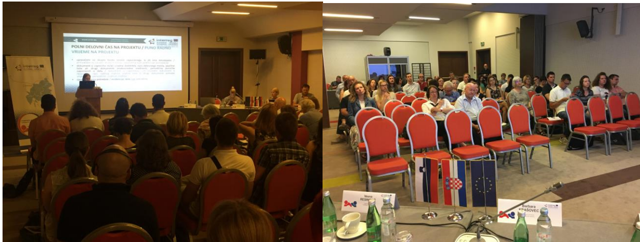
Workshops for the potential applicants within the 3 rd deadline of the Open Call

Within the 3 rd deadline for the submission of projects in the frame of the Open Call which closed on 27 September 2017 two workshops intended for potential applicants were carried out on 13 June 2017 in Postojna and on 20 June in Marija Bistrica. In the frame of the workshops the MA and JS presented the participants the Cooperation Programme, information concerning the Open Call, the Rules on the eligibility of the expenditure, the requirements concerning information and communication, the annexes to the application form, the electronic Monitoring System (eMS) and most common mistakes of the previous two deadlines and how to prepare good/quality projects.