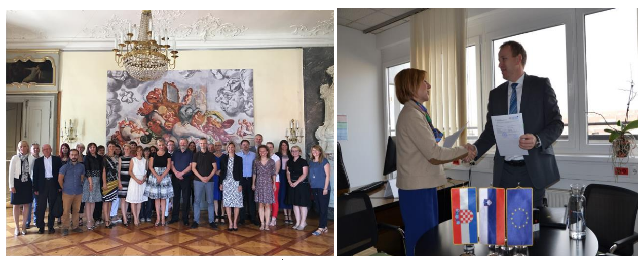
Subsidy contracts signing of the approved projects from the 2<sup>nd</sup> deadline of the Open Call and strategic project FRISCO 2.1

In the frame of the programme's website 50 news on activities, events and relevant information were published in 2017.