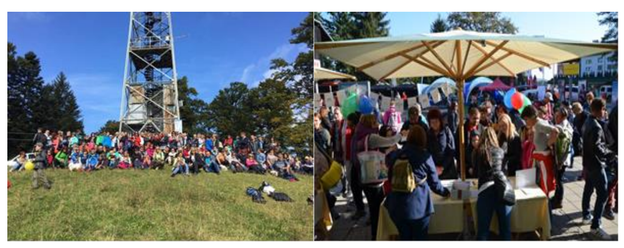
European Cooperation Day 2017