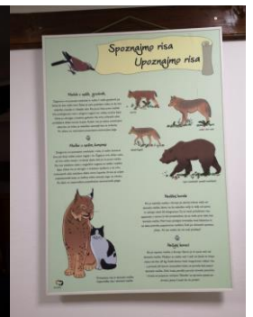
Programme event "Together for protection of biodiversity" and meeting of Slovenian and Croatian Minister in National Park Risnjak