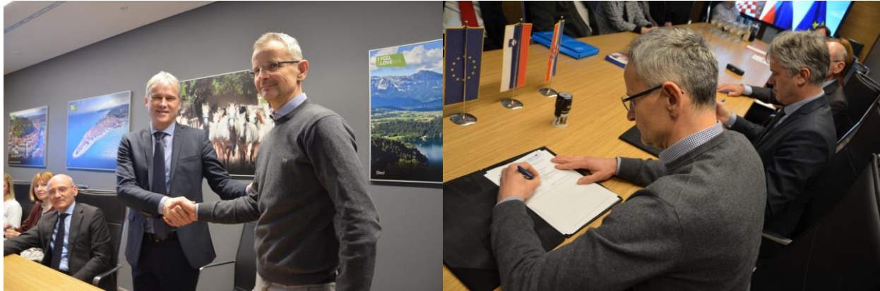
Ceremonial signing of the Subsidy contract for strategic project FRISCO 2.3