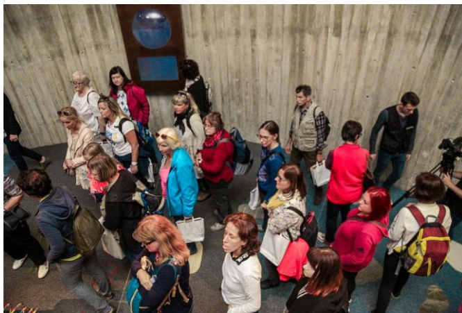
European Cooperation Day 2019