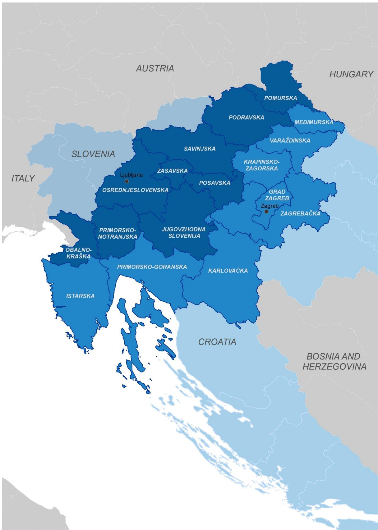
Map of the programme area is without prejudice to the border between the Republic of Slovenia and the Republic of Croatia. (Nothing in this document could prejudice the final delimitation between Croatia and Slovenia and the graphics and depictions of the border are exclusively for the purpose of this document.)